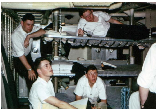
8 Mess – Prestonian Class Frigate 1961 Punka louvres – no Air Conditioning

Our program will focus on commemorating the Centennial of the Naval Reserves, and the accomplishments of its current and past members including those who took part in its the various officer training programs from the UNTD to the ROUPT, NROC and RESO and beyond.